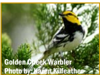
Golden-cheeked Warbler

(A) (Just west of Lago Vista on FM 1431) 22,000 acre refuge managed by Fish & Wildlife Service, established to protect the Golden-cheeked Warbler and Black-capped Vireo, endangered songbirds. Public areas: Warbler Vista, Doeskin Ranch, Shin Oak Observation Deck. Observation platforms and some of Doeskin trails are accessible. Special events for nature enthusiasts. Public Areas open 7 days sunrise-sunset (varies during April, Nov. & Dec.). Free. (512)339-9432 ▶▶www.friendsofbalcones.org .