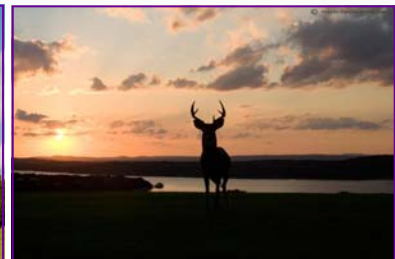
Lago Vista Area